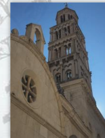
Cathedral of Saint Domnius

Authors of chosen papers will be notified and invited to amend and extend their papers for publication. The authors will be also invited to agree the publishing terms. MTSM Conference Proceedings for 2017 is indexed in SCOPUS database (Elsevier).