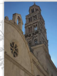
Cathedral of Saint Domnius

MTSM Conference Proceedings for 2019 is already indexed in SCOPUS database (Elsevier).