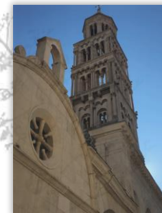
Cathedral of Saint Domnius

MTSM Conference Proceedings for 2019 and 2021 are already indexed in SCOPUS database (Elsevier).